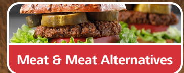
Meat & Meat Alternatives