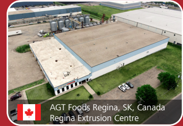
AGT Foods Regina, SK, Canada Regina Extrusion Centre