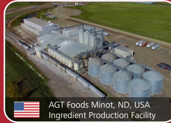
AGT Foods Minot, ND, USA Ingredient Production Facility

AGT Foods is a leading manufacturer of plant-based ingredients for premium markets and food companies around the world. From our facilities in Minot, ND, USA and Regina, SK, Canada, we produce nutritious, non-GMO, gluten-free and non-allergenic ingredient products , including pulse flours, proteins, fibres, V-6000™, de flavoured flours and crumb, as well as extruded products such as texturized pulse protein (TPP) and gluten-free pasta. We provide quality solutions for the global food marketplace.