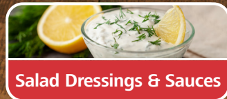
Salad Dressings & Sauces