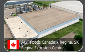
AGT Foods Canada • Regina, SK Regina Extrusion Centre