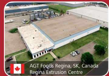
AGT Foods Regina, SK, Canada Regina Extrusion Centre