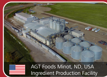
AGT Foods Minot, ND, USA Ingredient Production Facility

AGT Foods is a leading manufacturer of plant-based ingredients for premium markets and food companies around the world. From our facilities in Minot, ND, USA and Regina, SK, Canada, we produce nutritious, non-GMO, gluten-free and non-allergenic ingredient products , including pulse flours, proteins, Fibres, V-6000™, de flavoured flours and crumb, as well as extruded products such as texturized pulse protein (TPP) and gluten-free pasta. We provide quality solutions for the global food marketplace.