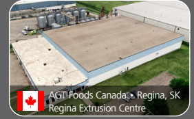
AGT Foods Canada • Regina, SK Regina Extrusion Centre