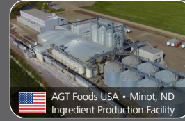
AGT Foods USA • Minot, ND Ingredient Production Facility

AGT Foods is a leading manufacturer of plant-based ingredients for premium markets and food companies around the world. From our facilities in Minot, ND, USA and Regina, SK, Canada, we produce nutritious, non-GMO, gluten-free and non-allergenic ingredient products, including pulse flours, proteins, fibers, V-6000™, deflavored flours and crumb, as well as extruded products such as texturized pulse protein (TPP) and gluten-free pasta. We provide quality solutions for the global food marketplace.