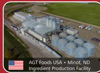
AGT Foods USA • Minot, ND Ingredient Production Facility

AGT Foods is a leading manufacturer of plant-based ingredients for premium markets and food companies around the world. From our facilities in Minot, ND, USA and Regina, SK, Canada, we produce nutritious, non-GMO, gluten-free and non-allergenic ingredient products , including pulse flours, proteins, fibres, V-6000™, deflavored flours and crumb, as well as extruded products such as texturized pulse protein (TPP) and gluten-free pasta. We provide quality solutions for the global food marketplace.