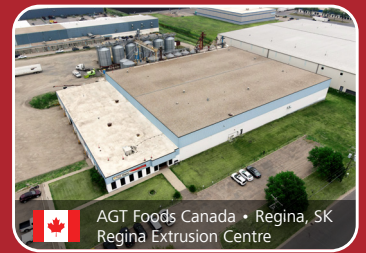
AGT Foods Canada • Regina, SK Regina Extrusion Centre